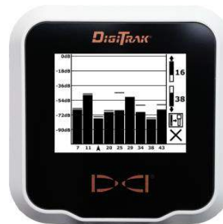
Falcon Frequency Optimizer

Upon completing the scan, the receiver displays a simple chart that depicts the noise levels across several bands. Select the two quietest bands and pair with the Falcon wideband transmitter. In areas with varied interference, switch between bands to stabilize data readings and complete the bore. For extreme interference, engage Max mode for maximum performance.