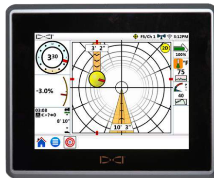
Aurora Touchscreen Display

Product ID/Model number ..... AF10 Power source ..... 10–28 VDC Current.....2.1 A maximum Controls..... 10.4 in. touchscreen Graphic display ..... LCD Audio output..... Speaker Telemetry range 2 .....1800 ft. Telemetry channels..... 4 Operating temperature..... -4 to 140° F Dimensions 4 ..... 11.5 x 9.3 x 2.3 in. Weight.....6.4 lb